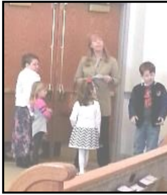
Holly Meade Children's Church