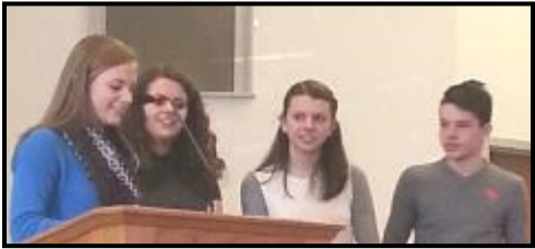
Youth Announcing Winner of WBC "Souper" Bowl